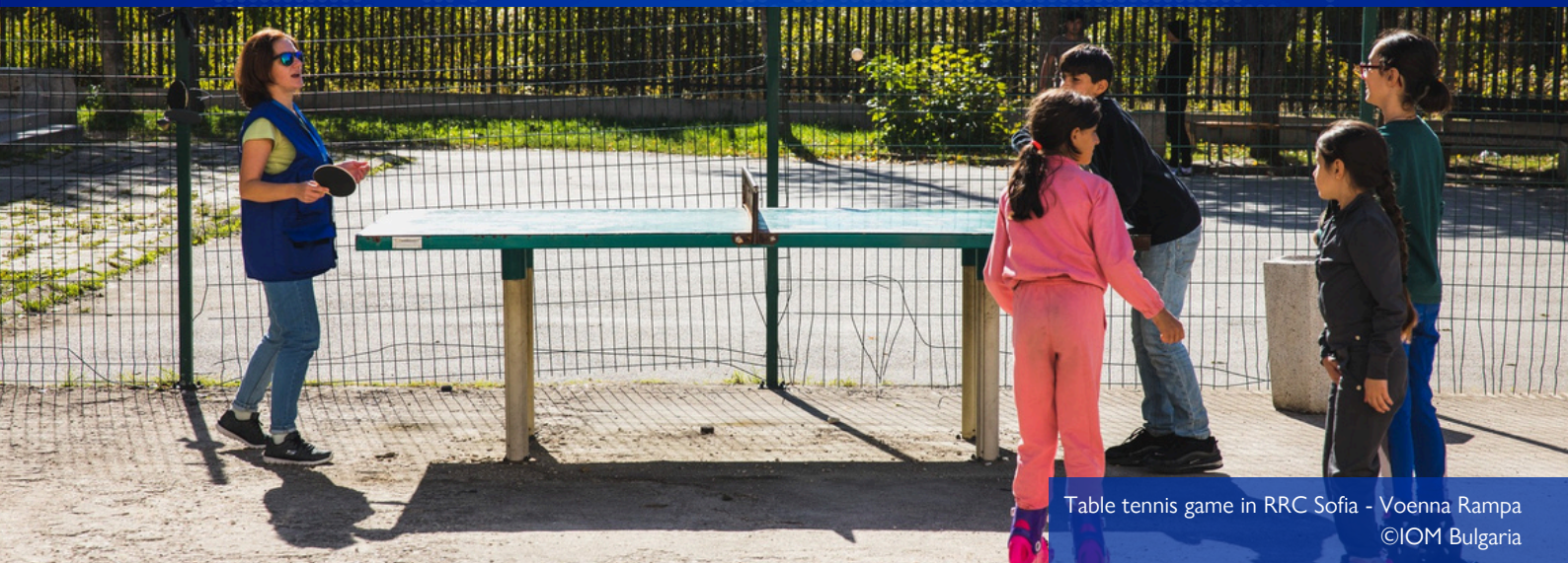
Table tennis game in RRC Sofia - Voenna Rampa