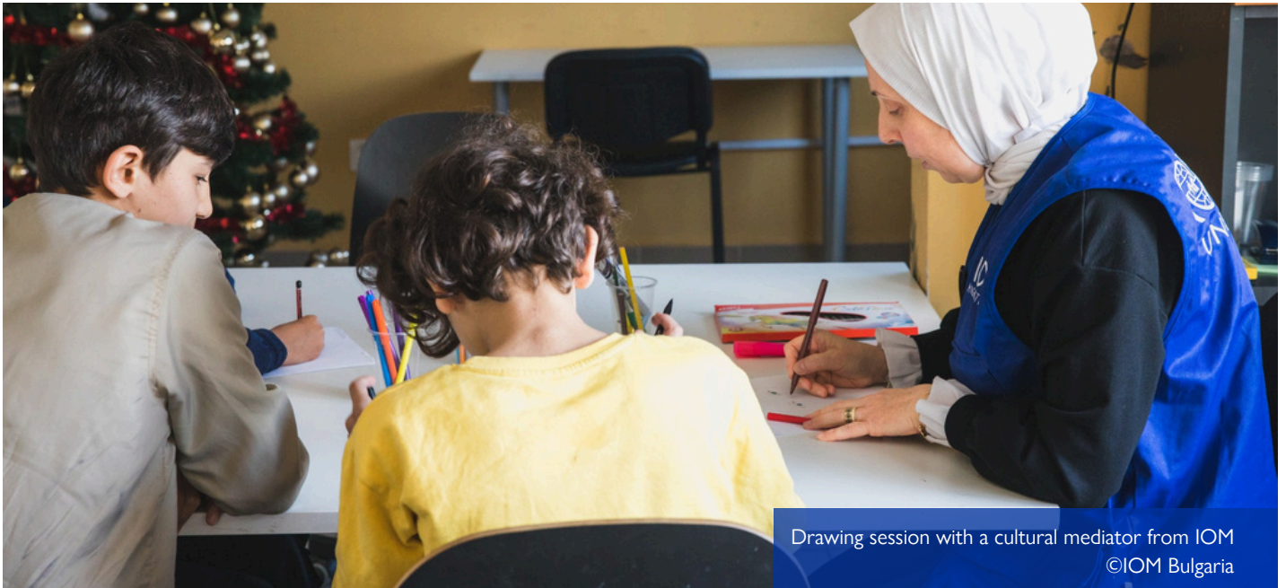
Drawing session with a cultural mediator from IOM