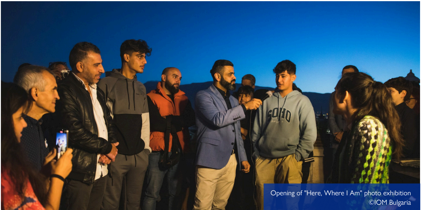
Opening of "Here, Where I Am" photo exhibition